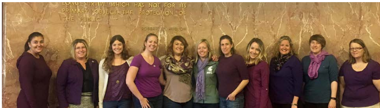
WLAM State Board wearing purple for Domestic Violence Awareness Month